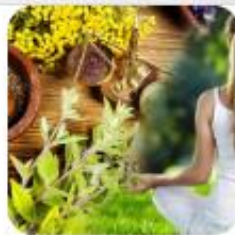
Naturopathy and Yoga