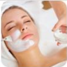
Beauty and Wellness