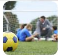
Sports and Physical Education